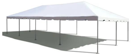
SHARED MARKET TENT 30 x 45 (8) 10 x 10 Spaces, open on all sides with an overhang