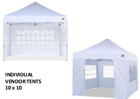
INDIVIDUAL VENDOR TENTS 10 x 10